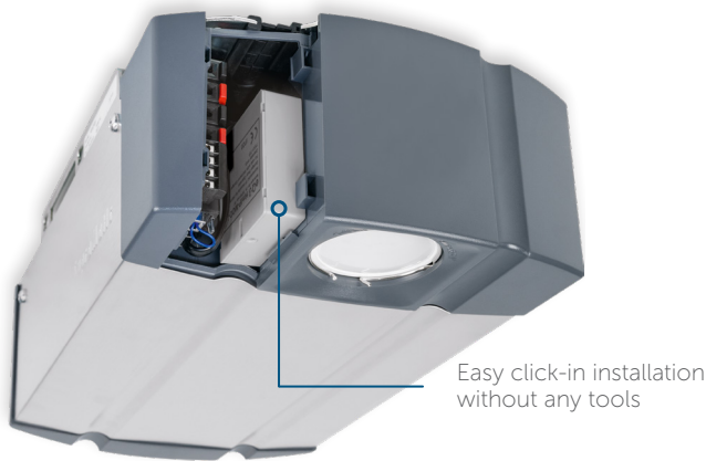
Easy click-in installation without any tools